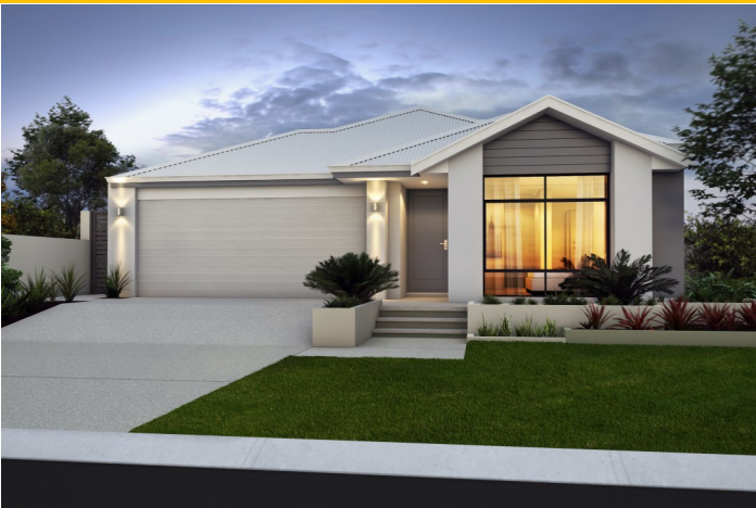
Lot 1040 Sutcliffe Retreat, South Yunderup